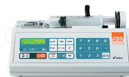
• SP-12S PRO