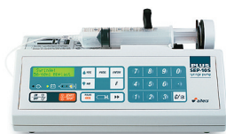
• SEP-10S PLUS