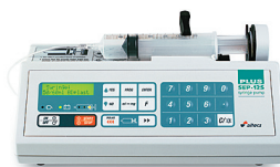
• SEP-12S PLUS